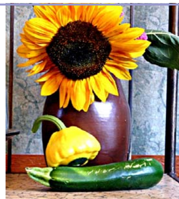
Wade Outland's still life

It's high summer and we've got such bounty coming from the farm! Since the vegetables that are in season now are so good in stir-fries, I've included a little information that I've found helpful lately about doing stir-fry dishes that really have that Chinese crisp-tender kick. And in case you still have squash left over, I've included a little something to keep all those healthy stir-fries under control—deep fried squash! Thanks so much for all the recipes you send me! And don't forget the pictures!